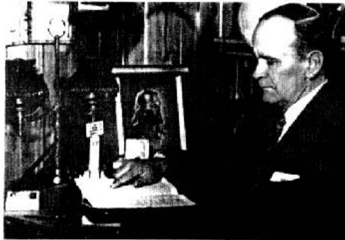
Singular Head: William Branham, The Prophet - Star Messenger to this age. (Major Messenger)