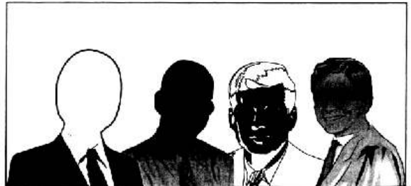
The Apostolic Head: The Head of the end time original Ephesian Ministry

Note: The number of persons portrayed in the Apostolic Head does not indicate the number of men that will make up this Head. It is merely representative.